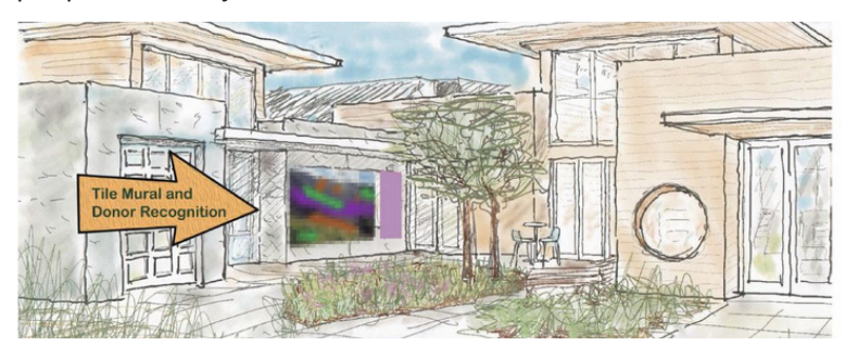
There's still time to donate! Please visit <u>www.fobl.info</u> to donate and put your mark on the new Library today!

Do you love your library? Would you like to have a say in its future? Come to a Friends of the Brisbane Library meeting. New people are always welcome.