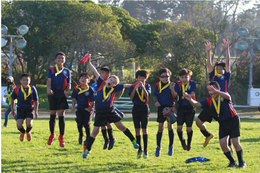
Brisbane AYSO 12U boys' team at the 30th Annual Turkey Tournament in San Bruno

Brisbane AYSO youth soccer wrapped up an exciting fall 2021 season with a record number of players enrolled. A total of 184 players (that's 21 teams!) were on the field this fall, building their soccer skills and having fun with their teammates. Five of Brisbane's 10U and 12U teams advanced to the area playoffs, where they faced off against teams from San Bruno, Millbrae, Pacifica, and Daly City.