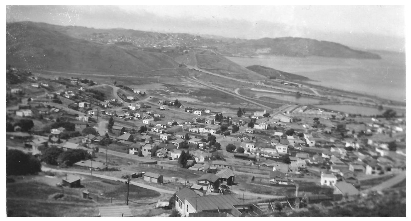
View of Brisbane, c. 1930s

The Brisbane Historical Community is a group of Brisbane residents that are dedicated to sharing Brisbane's history and stories. Meetings are held as-needed at City Hall (they have not been meeting during the pandemic).