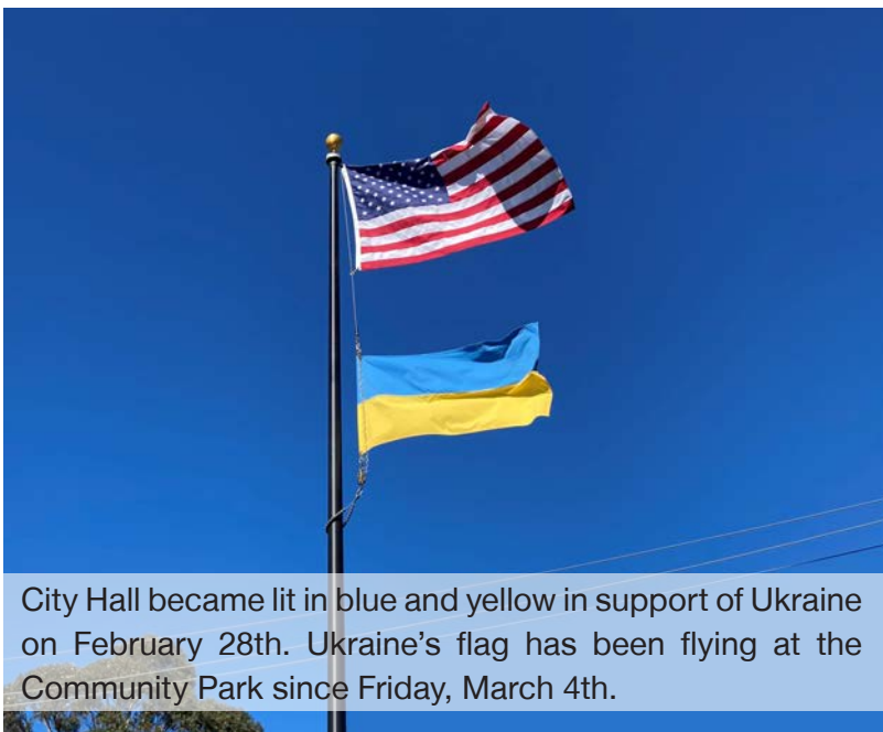
City Hall became lit in blue and yellow in support of Ukraine on February 28th. Ukraine's flag has been flying at the Community Park since Friday, March 4th.