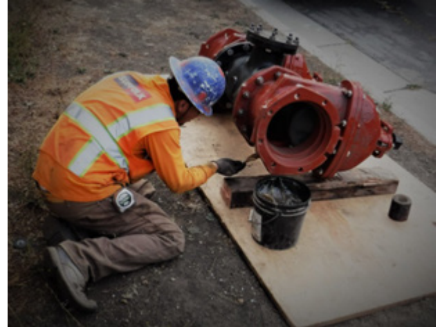
Water Main Replacement Project on Kings last year.

Lastly, we know these are tough times for some residents in our community and want to make sure you know that our Core Service Agency, the Community Resource Center of the YMCA, offers financial assistance on things such as your utility or PG&E bill. Bring documentation to the CRC office in SSF located at 1486 Huntington Ave., So. San Francisco, call them at 650-276-4101, or email them at crc@ymcasf.org .