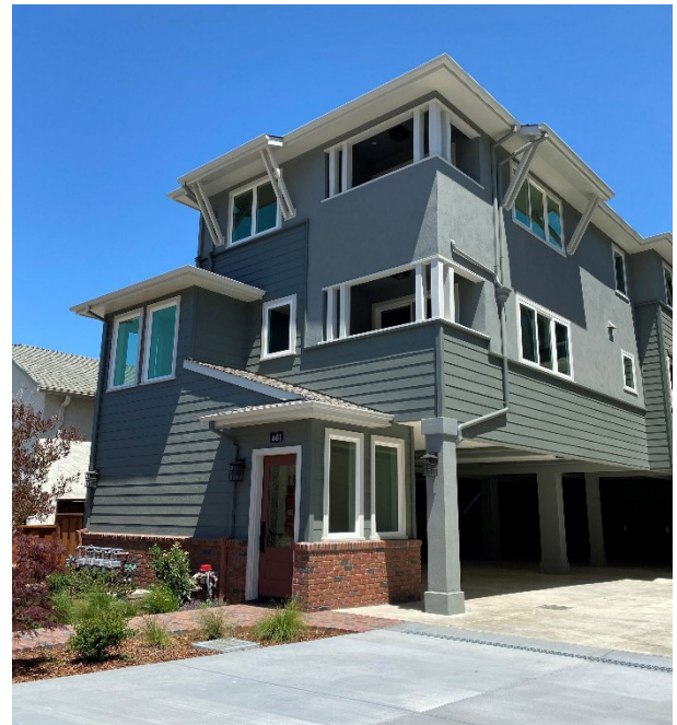
Recently constructed multi-unit complex located at 661 San Bruno.

We thank you for your time and hope you stay engaged with us as we move through the process of reviewing the 2023-2031 Housing Element this fall!