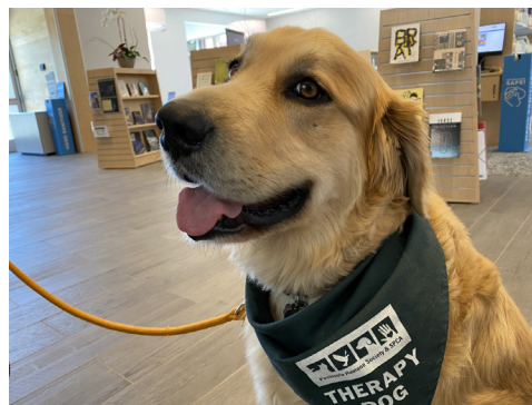
Buddy is Brisbane's volunteer dog for the monthly Paws for Tales program.

Sunday, January 1, 2022 - Monday, January 2, 2023, for New Year's and Sunday, January 15, 2023 - Monday, January 16, 2023, in honor of Martin Luther King Day.