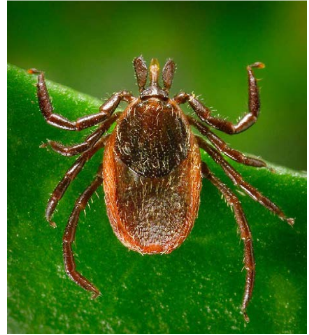
Adult western black-legged ticks are most active in the wet months from December through March.

District staff can identify ticks and answer your questions about ticks. For more information on ticks in San Mateo County, visit smcmvcd.org/ticks .