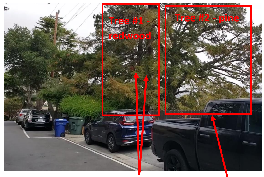
View from the street. Redwood tree (splits into two with the same trunk) and pine tree