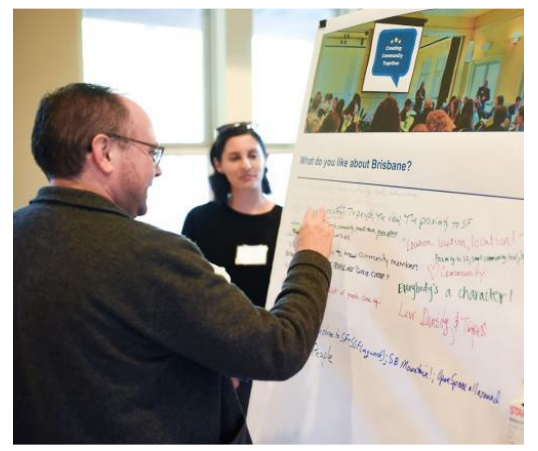
March 21, 2019 Community Conversation

The City partnered with San Mateo County's Home for All initiative and the Peninsula Conflict Resolution Center (PCRC) to host two community conversations in March and May regarding the Baylands subarea. The purpose of the community conversations was to share community concerns and ideas for the upcoming specific plan from the developer in the wake of Measure JJ. The community conversations were attended by 87 and 65 community members, respectively, and featured unstructured conversations based on topics and prompts, mediated by PCRC staff.