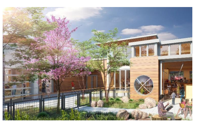
Rendering of Brisbane Library