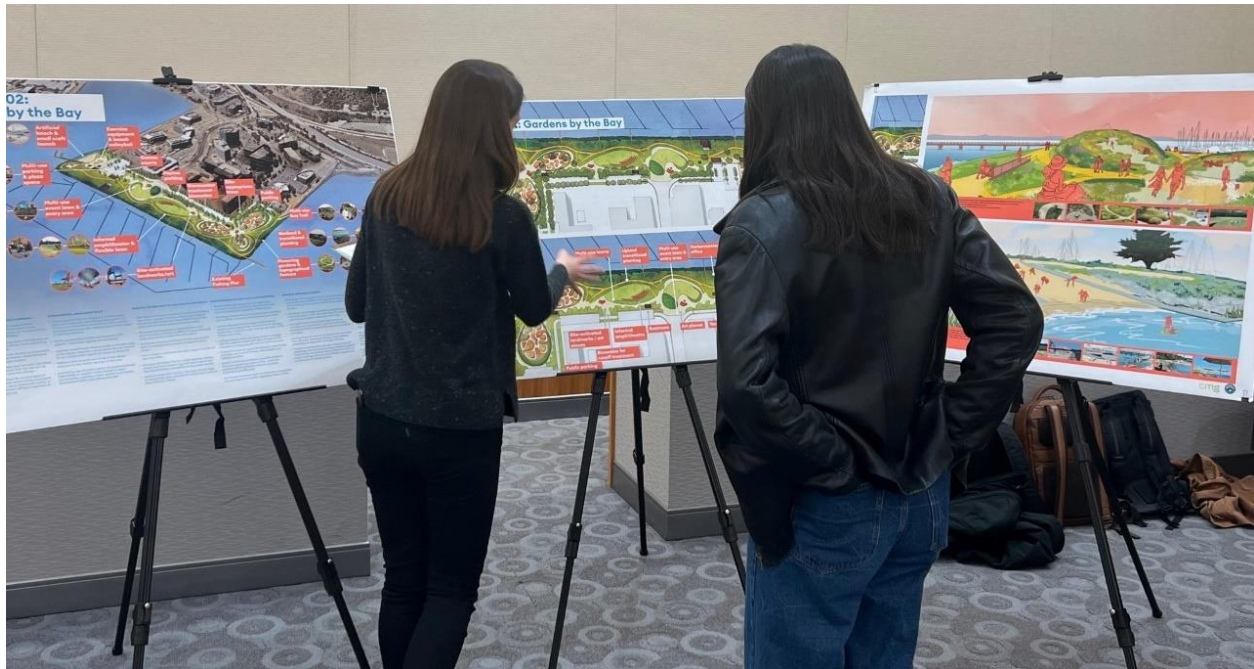
Sierra Point Open Space and Parks Master Plan Community Workshop