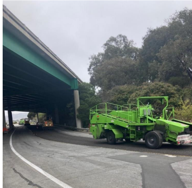
Sierra Point Parkway Pavement Maintenance

2021-20 on February 18, 2021. This program provided grant funding to public agencies that utilize recycled, waste-tire materials to perform cost-effective cape seal pavement maintenance. As a result of Brisbane's participation in this program, 2,083 waste tires were diverted from going to a landfill and recycled.