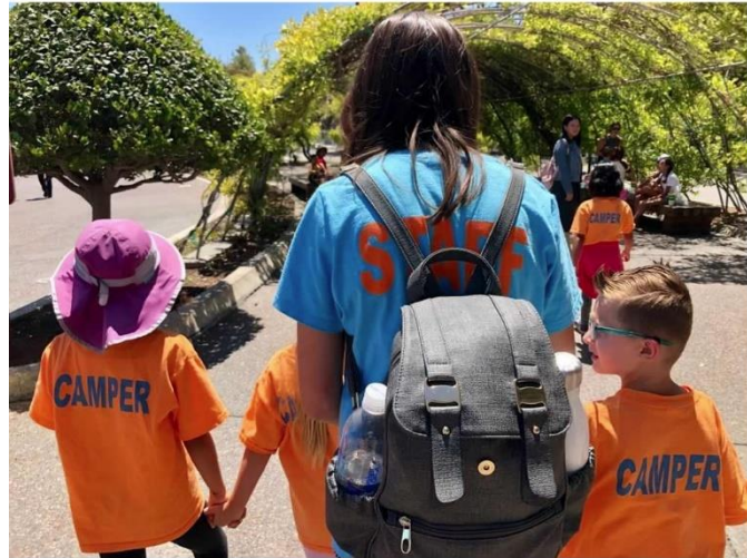
Brisbane Summer Camp