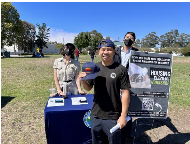
1 City staff tabling at the Farmer's Market

Government Code Section 65583(c)(8) requires the City to “make a diligent effort to achieve public participation of all economic segments of the community in the development of the housing element.” In order to meet this requirement, the City undertook various means of gaining community input on the 2023-2031 Housing Element. A number of events were offered to the public through both our participation in the Countywide 21 Elements collaborative and through the Planning Commission or City Council as study sessions and workshops, from early 2021 through July 2022, leading up to the preparation and publication of the draft Housing Element in August 2022. All workshops and meetings prior to February 2023 were held virtually and were available to participate or view live, or view after the event, due to COVID-19 restrictions. However, the City did provide numerous in-person engagement opportunities in 2022 as in-person community events gradually resumed.