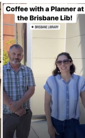
23 Staff tabling at the Brisbane Library