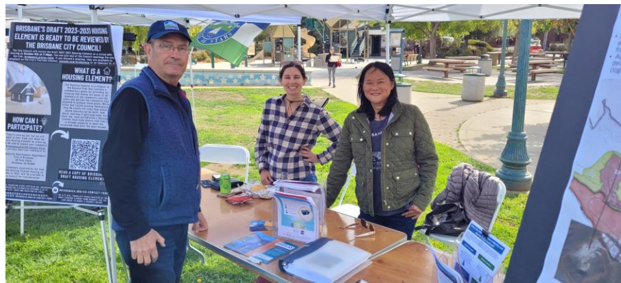
4 Staff and Planning Commissioners tabling at Day in the Park

Following the City Council’s adoption of the Housing Element on February 2, 2023, the Element was submitted to HCD. On April 5, 2023, HCD provided additional comments to be addressed prior to their certification. HCD’s April 5 comment letter along with the redlined edits were posted for the public review and comment on the City’s website, emailed to the interested parties list and posted on the City’s social media platforms on May 5. Paper copies of these materials were also made available at City Hall and at the Brisbane Library on May 8. This was more than 7 days prior to City Council’s public hearing on May 18 on the proposed revision to Housing Element and the subsequent resubmittal to HCD for state certification, consistent with the Gov’t Code.