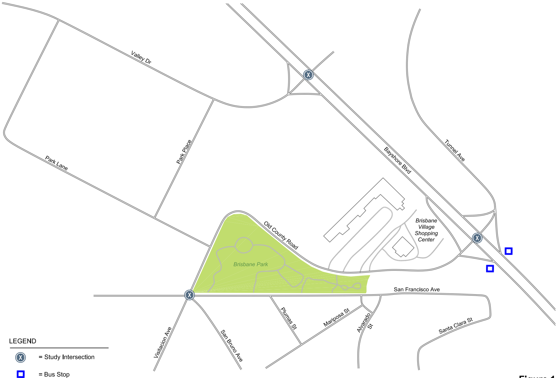
Figure 1 Study Area