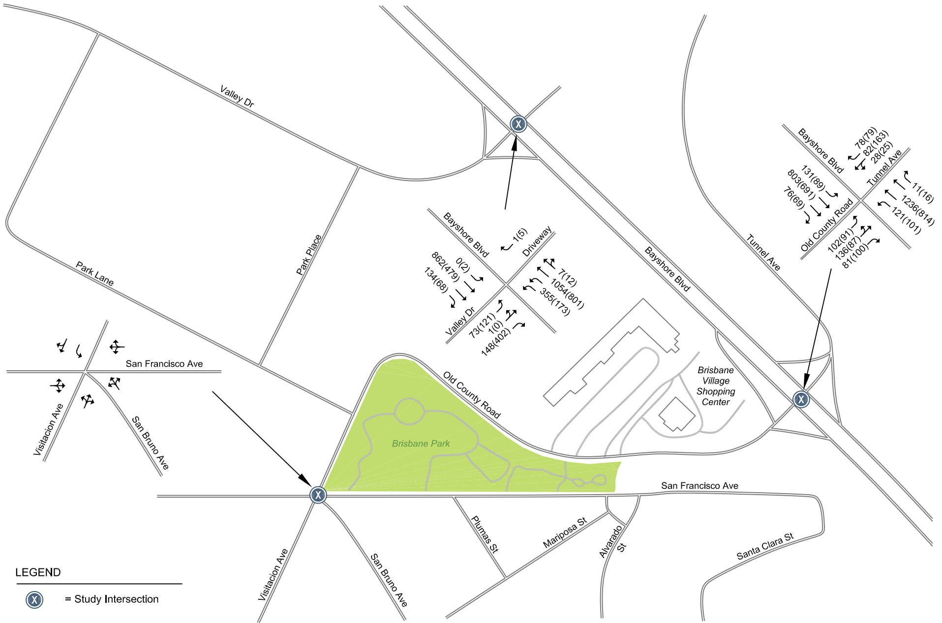
Figure 3 Intersection Lane Geometry & Existing Traffic Volumes