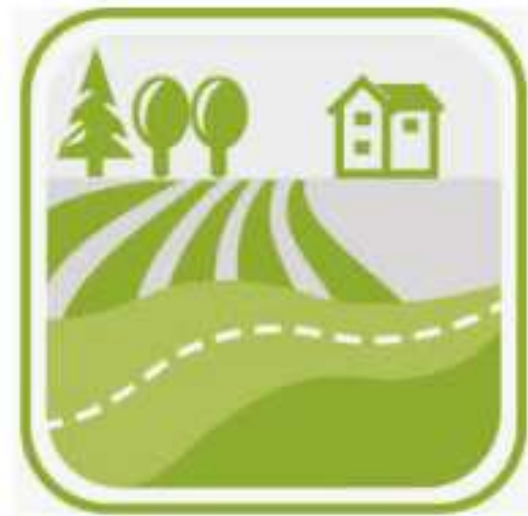
Land Use Permit(s)