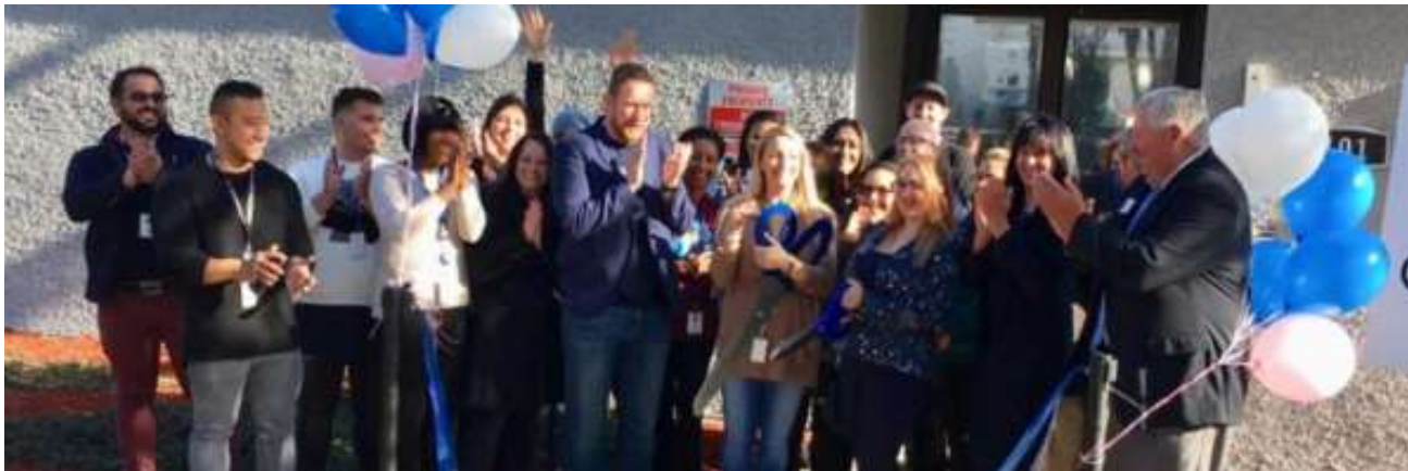
The ribbon-cutting for Brisbane's first cannabis business in December 2018