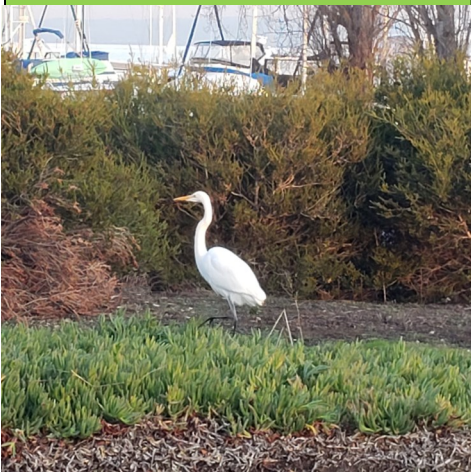
Egret looking for a snack